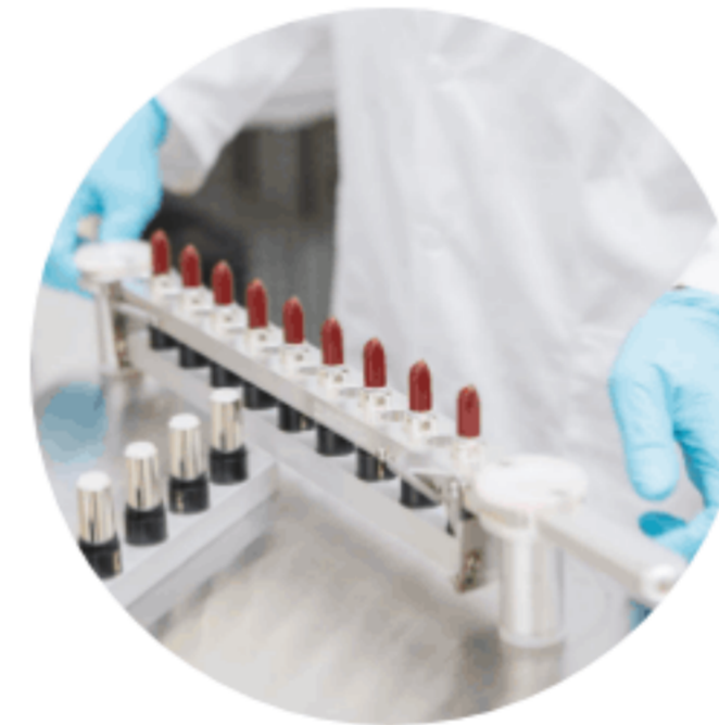
Expertly Manufactured in Our Facility