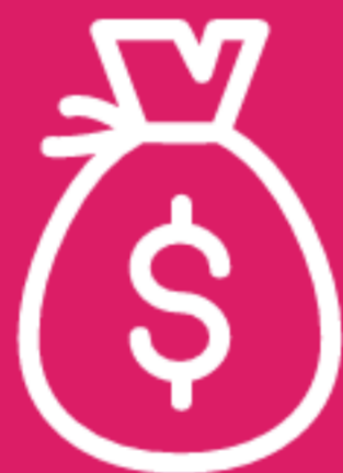
Access to Capital