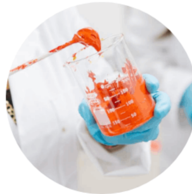
Expertly Formulated by HN