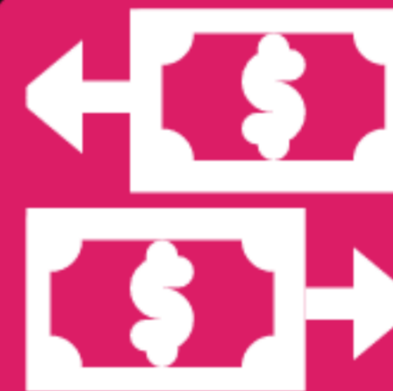
Revenue vs. Cash Flow