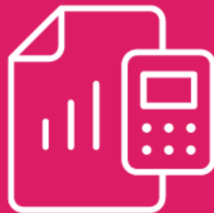
Understand Your Margins